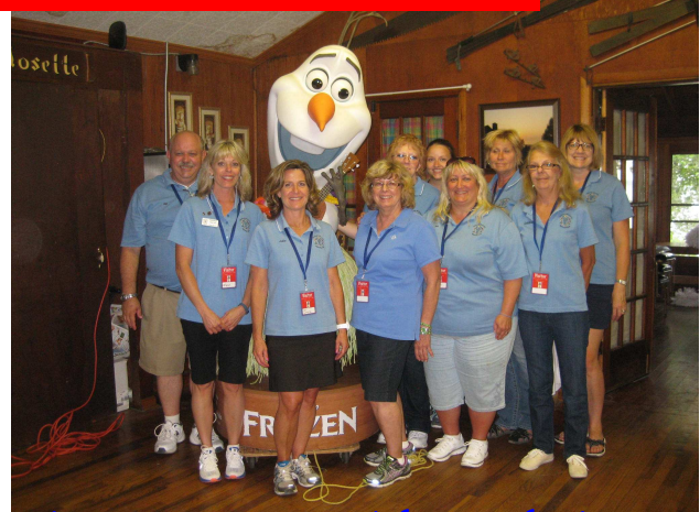
The Optimist Group & Olaf waiting for the kids

Champions for Life Kids' Camp is a summer camp program designed with the foster child in mind. The camp experience is geared for success in building self-esteem and recognizing the special needs of abused, abandoned and neglected children ages 7-11 in our local communities. CMOC was honored to help throw a birthday party for the kids which includes more crepe paper than you will ever see, balloons, themed plates/napkins/blowers, individual cakes & lots of love!